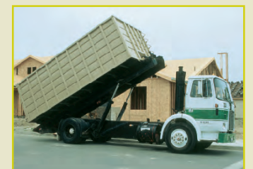
Debris Box Services