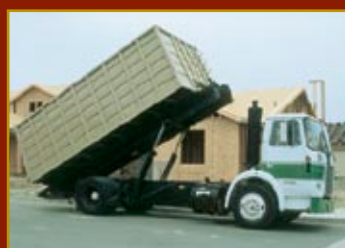
Debris Box Services