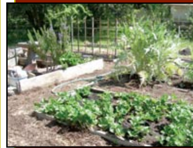
Spring garden. Just wait 'til fall!

Summer is a time for enjoying the great outdoors and all that the North Bay has to offer. For many of us, that includes time spent in the garden, reaping the harvest of fresh fruits, vegetables and flowers that grow so well in our County.