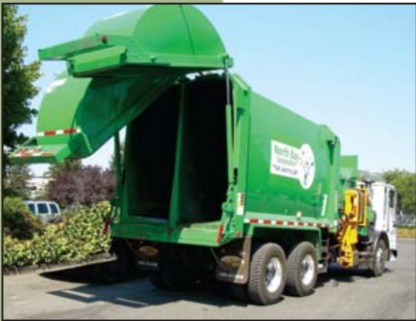
Brand new collection vehicles have two compartments. These vehicles can pick up recycling and garbage in one trip through your neighborhood.

bid process, WRR was awarded the new 10 year contract to continue to provide collection services to the Town. There will be some new and enhanced services to customers as well as an all new collection vehicle fleet! Watch for the new "split-body" collection vehicles that will be serving Windsor neighborhoods. These vehicles are built with dual compartments so that garbage and recycling can both be collected in the same vehicle. This reduces truck trips through your neighborhood by 1/3, reducing greenhouse gas emissions as well as wear and tear on neighborhood streets. Included in the Agreement is a new rate structure that rewards customers who reduce waste and recycle more. The WRR website ( www.unicycler.com ) lists numerous resources available to customers to promote waste reduction. In addition, outreach staff are available to work with businesses to identify strategies for waste reduction, including site audits and staff training. Windsor Refuse and Recycling is proud to have been your service provider for the past 10 years and looks forward to continuing to