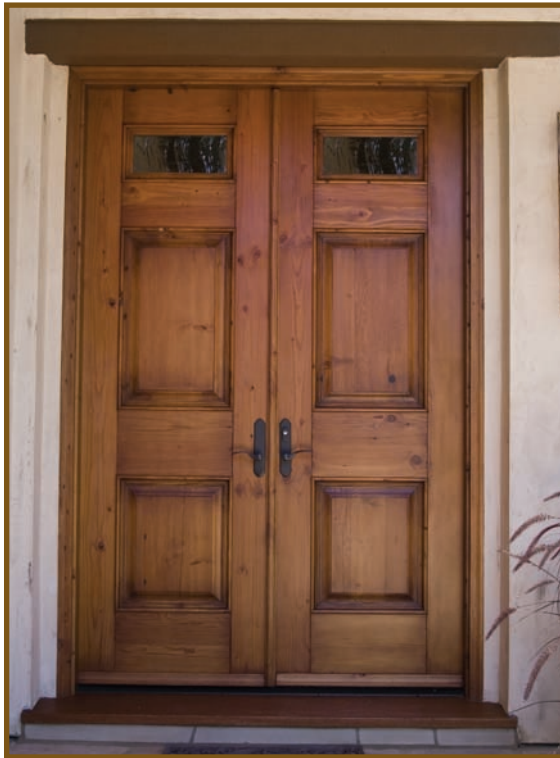
door at a private residence, created by Liberty Valley Door

Packaging is often one of the largest waste products that businesses generate from receiving and shipping product. LVD addressed this problem challenging their suppliers to provide packaging that is only made out of recyclable materials. Most of the wood that is used to make their custom doors is either salvaged locally or certified by the Forest Stewards Council. All excess scrap wood is donated to the public and local schools while the sawdust that they produce is donated to local farmers to be used as animal bedding. LVD has taken important steps in reducing the waste that they generate. As if that wasn't enough, they have installed a 117KW Solar Power System which will provide 100% energy offset of their energy usage. They have even purchased a hybrid SUV for their GM who drives more than 120 miles a day. We would like to thank Liberty Valley Door for their amazing achievements in reducing their ecological and carbon footprint in Sonoma County and to encourage other businesses and residents to join them in their efforts towards a more sustainable future.